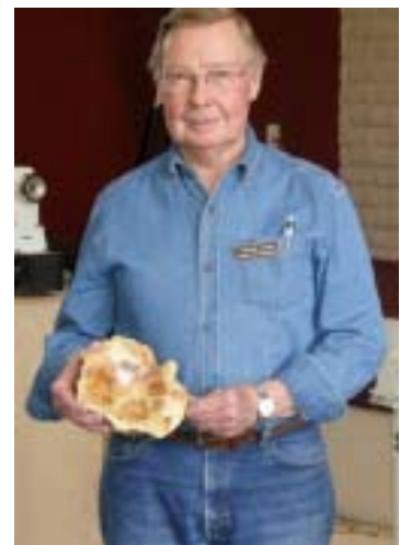
April Instant Gallery -- Everyone's a winner!