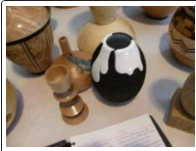
July Instant Gallery